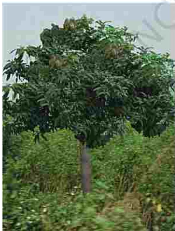
Fig. 5.3 (a) : Wild Mango

Madhavji shows sal and wild mango (Fig. 5.3 (a)) as two examples of the