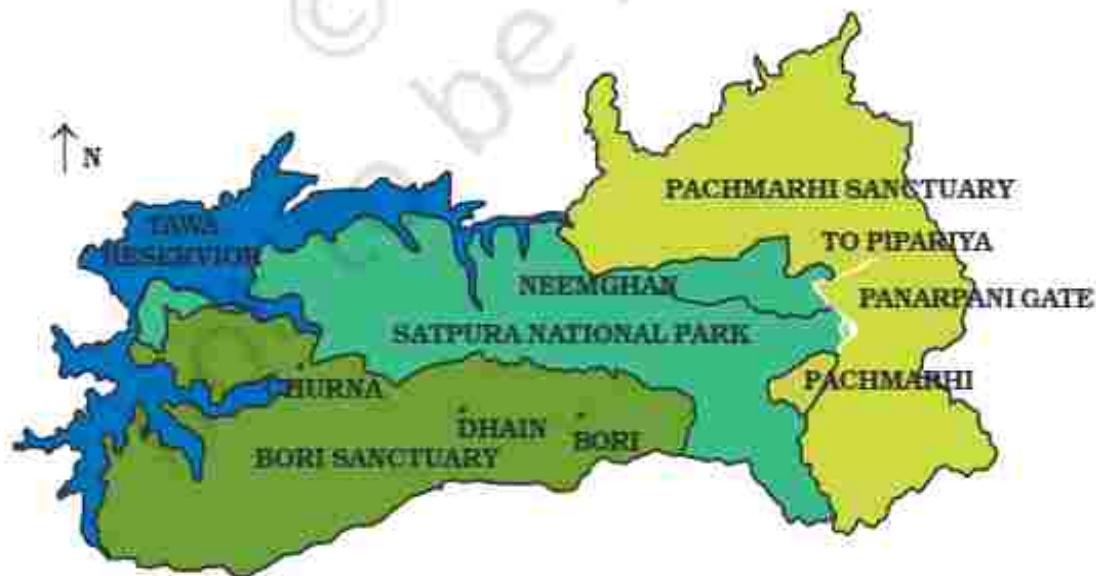
Fig. 5.1 : Pachmarhi Biosphere Reserve