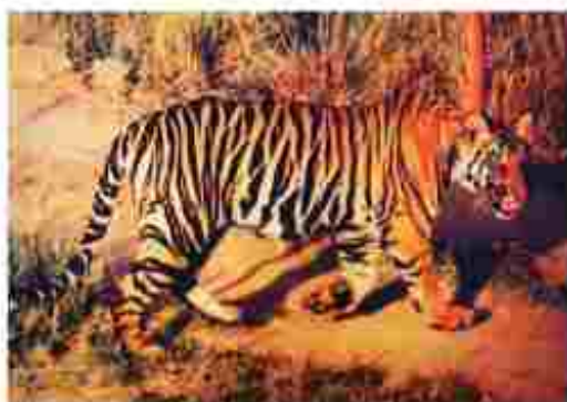
Fig. 5.4 : Tiger

Tiger (Fig. 5.4) is one of the many species which are slowly disappearing from our forests. But, the Satpura Tiger Reserve is unique in the sense that a significant increase in the population of tigers has been seen here. Once upon a time, animals like lions, elephants, wild