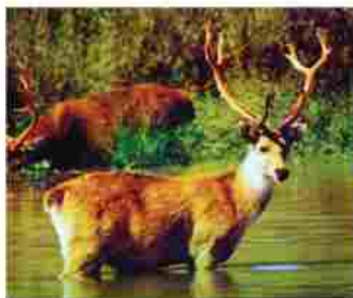
Fig. 5.6 : Barasingha

animals has become difficult because of disturbances in their natural habitat. Professor Ahmad tells them that in order to protect plants and animals strict rules are imposed in all National Parks. Human activities such as grazing, poaching, hunting, capturing of animals or collection of firewood, medicinal plants, etc. are not allowed