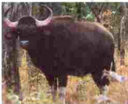
Fig. 5.5 : Wild buffalo

buffaloes (Fig. 5.5) and barasingha (Fig. 5.6) were also found in the Satpura National Park. Animals whose numbers are diminishing to a level that they might face extinction are known as the endangered animals . Boojho is reminded of the dinosaurs which became extinct a long time ago. Survival of some