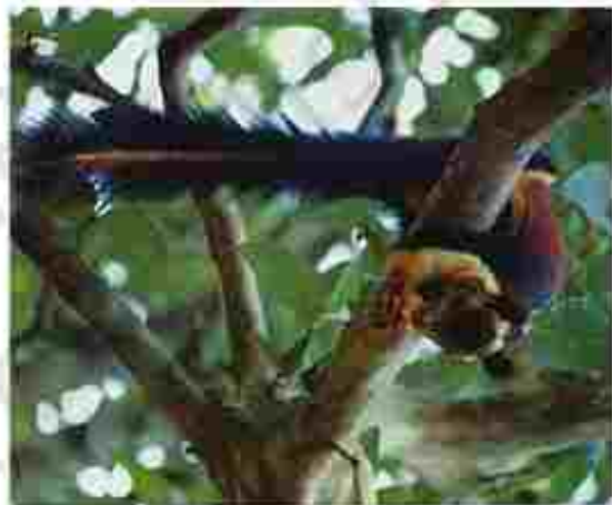
Fig. 5.3 (b) : Giant squirrel

endemic flora of the Pachmarhi Biosphere Reserve. Bison, Indian giant squirrel (Fig. 5.3 (b)) and flying squirrel are endemic fauna of this area. Professor Ahmad explains that the destruction of their habitat, increasing population and introduction of new species may affect the natural habitat of endemic species and endanger their existence.